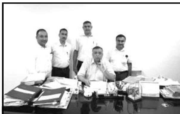
A moment with honourable Education Minister of Assam