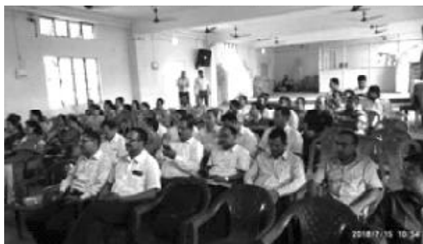
A moment of august gathering at ACLA & S B Deorah College organized state level workshop for College Librarians' of Assam on 15 July, 2018 held at S B Deorah College, Guwahati.