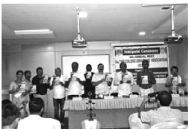
A moment of inauguration of ACLA Bulletin at North Lakhimpur College (Autonomous) on 24 June, 2017