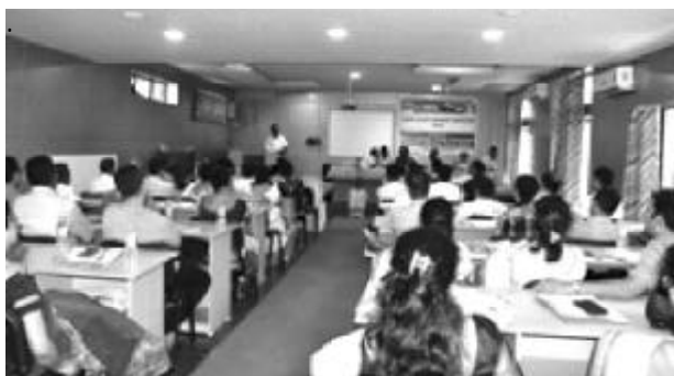
A moment of ACLA Annual Meet at North Lakhimpur College (Autonomous) on 24 June, 2017.