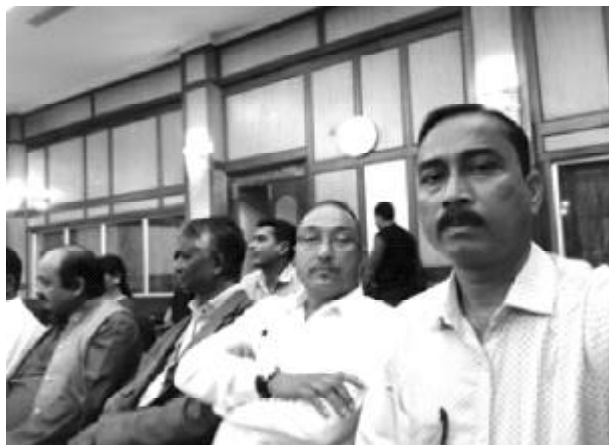
A moment with august gathering at Speakers Meet at Dispur on 7 th of March, 2018 with ACLA representatives.